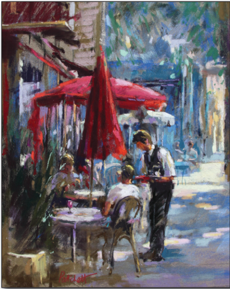
Ice with a Slice 15" x 12"