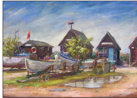
Fishermen's Huts, Southwold Harbour 20" x 25"