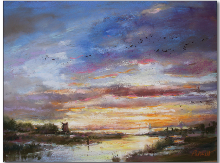
Broadland Sunset 10.5" x 13.75"