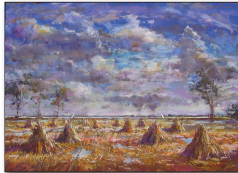
Broadland Harvest 17.5" x 23.75"